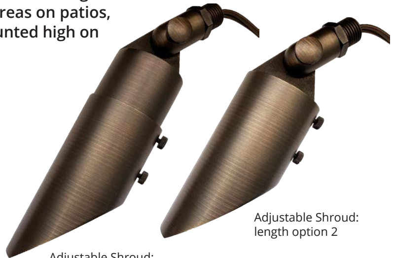
Adjustable Shroud: length option 1